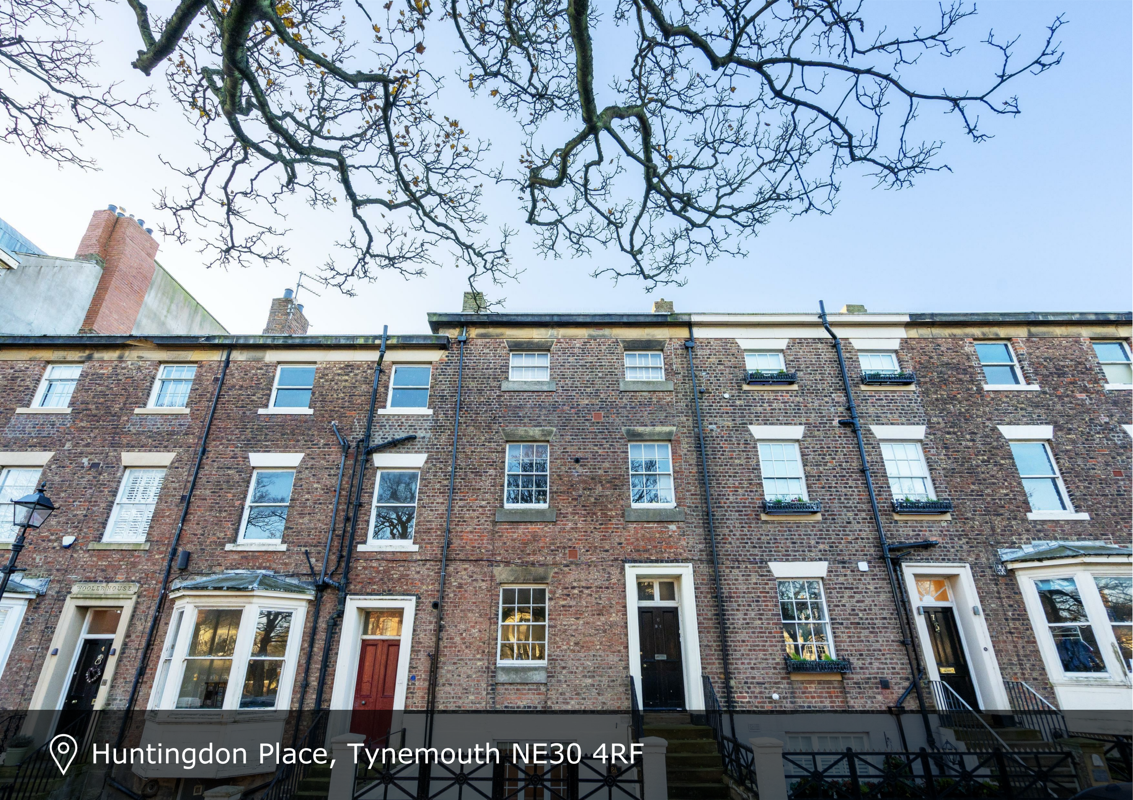
📍 Huntingdon Place, Tynemouth NE30 4RF